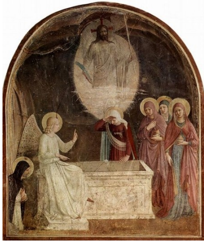
The Resurrection of Christ