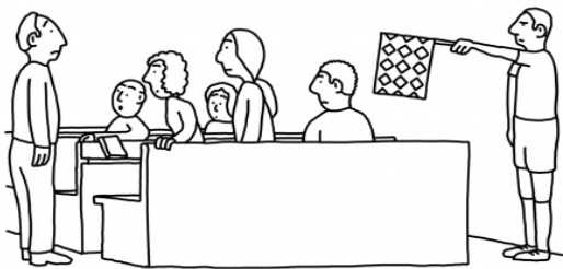
PEOPLE WHO KEEP AN EYE ON THINGS FROM THE SIDE AISLES

COMMON MISUNDERSTANDINGS ABOUT THEIR ROLE