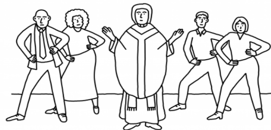
BACKING DANCERS FOR LITURGICAL ROUTINES