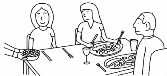
FRIENDS WHO ONLY ORDER CHIPS AT A RESTAURANT