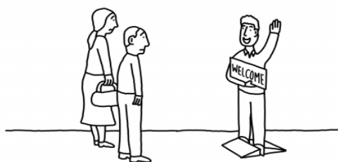
PERSONS MADE UP ONLY OF SIDES